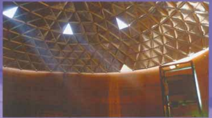
...an inside view.