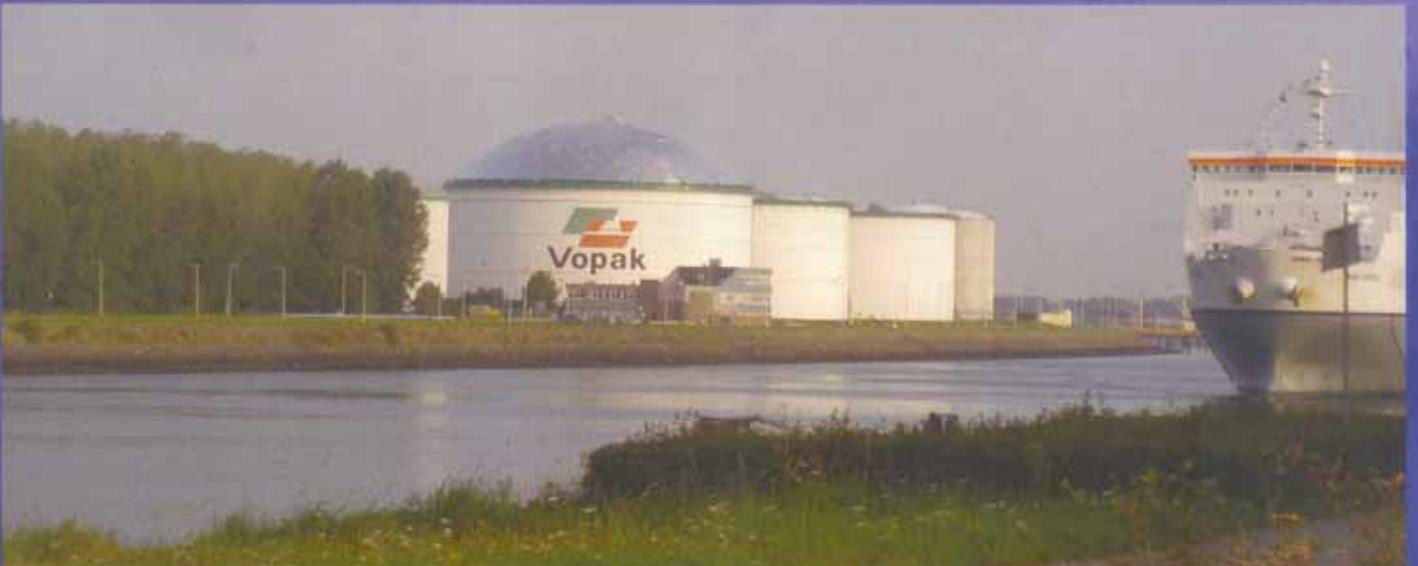
AFTER: the new dome in place.