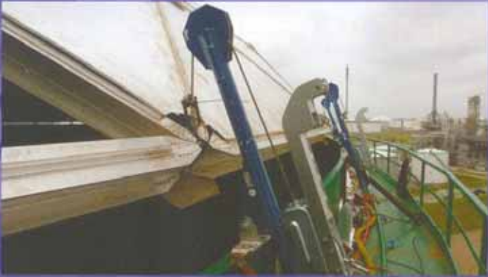
The dome reaches its final position at the top of the tank.