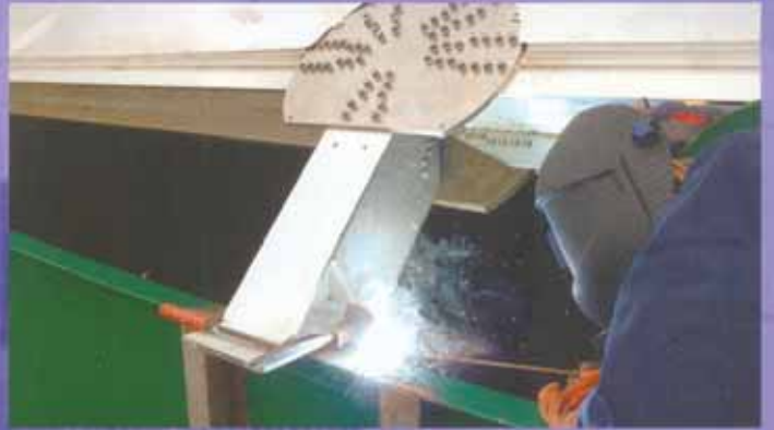
The dome's sliding supports are welded into place. The dome will slide within these supports to allow for expansion and contraction as a result of temperature change.