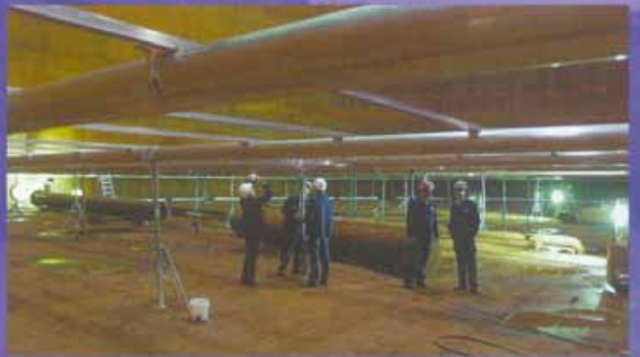
Guests of CTS and Vopak get a close up view of the IFR during assembly.