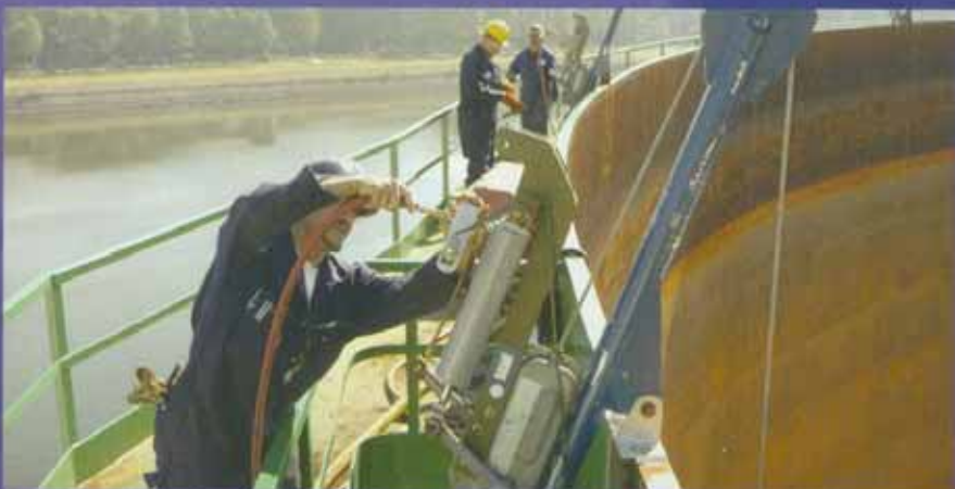
The dome is ready to be lifted using grip hoists.