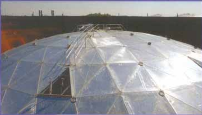
The lift in progress...