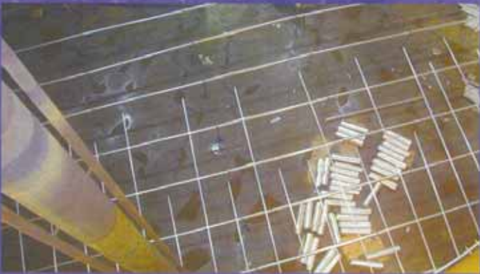
The internal floating roof is assembled inside the tank, on temporary legs.