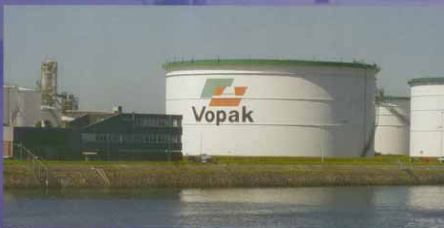
BEFORE: tank 903 at the start of the project.